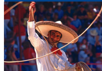
Enjoy the sights and sounds of San Antonio