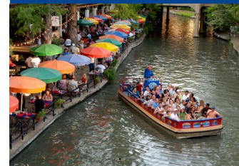
Relax on a cruise at the famous River Walk